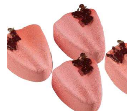
SSM032 118x95x35mm (4und)