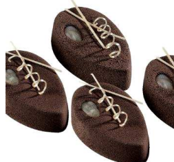
SSM031 110x65x32mm (4und)