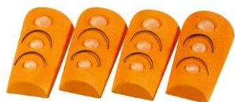
SSM024 110x62x33mm (4und)