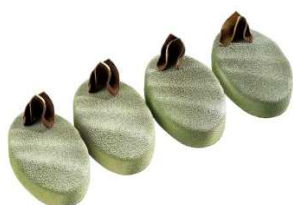
SSM027 118x74x30mm (4und)