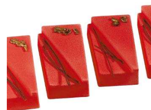
SSM035 110x54x30mm (4und)