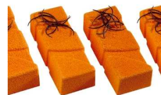
SSM038 110x42x33mm (4und)