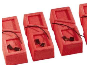
SSM036 110x44x32mm (4und)