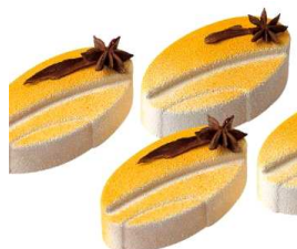
SSM030 103x55x30mm (4und)