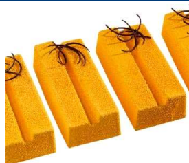
SSM034 111x52x33mm (4und)