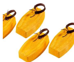
SSM028 110x57x32mm (4und)