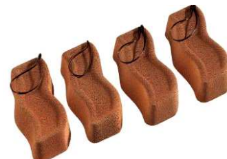
SSM026 120x48x32mm 4und