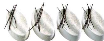
SSM029 110x60x33mm (4und)