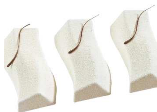
SSM033 120x60x30mm (4und)